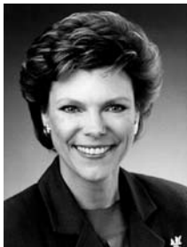
Steve and Cokie Roberts